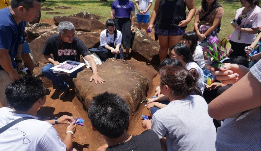
7.20.2k16... "The Change Academy" haumana experienced Kūkaniloko. Following Protocol of Kahea, Hoʻokupu, Pikai, a me